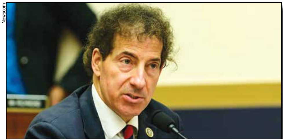
Radicalizing students and Congress: Rep. Jamie Raskin (D-MD) founded “Democracy Summer” to train and deploy students as political organizers on behalf of “progressive” candidates. Raskin’s father was co-founder of the pro-Communist “Institute for Policy Studies.”

Since her recent election to Congress as its youngest woman member ever, Ocasio-Cortez has received massive positive attention from the Establishment media. The attention