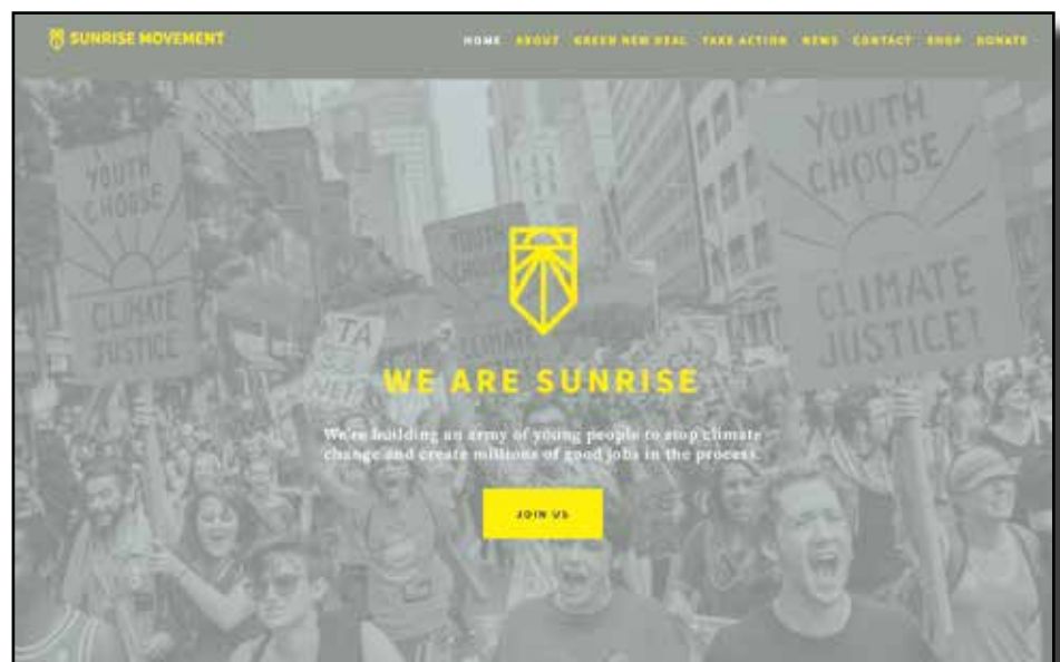
New Leftist front group: The highly developed Sunrise Movement is “Building an army of young people to stop climate change....”

The Establishment media regularly treat both of these organizations as reliable authorities. For example, Yahoo News (12-7-18) quoted spokesmen from both organizations in “Climate change is already here, scientists say, and it’s killing us.”