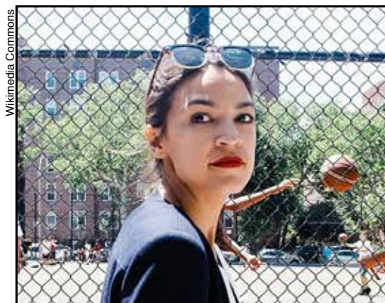
Alexandria Ocasio-Cortez: With far-Left support, the youngest ever (age 29) member of the new Congress champions a “green new deal.”

The House first passed H.R. 6 in June. But now, with additional provisions, it has passed both chambers, and President Trump has signed it into law. Only eight representatives voted against the final measure: Justin Amash (R-Michigan),