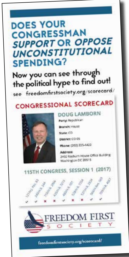
Share the scorecard trifold: Americans need help to see past the political hype!

The originating organization behind this push is unclear. But what appears to be the main webpage for this proposal ( http://citizeninitiatives.org/ )