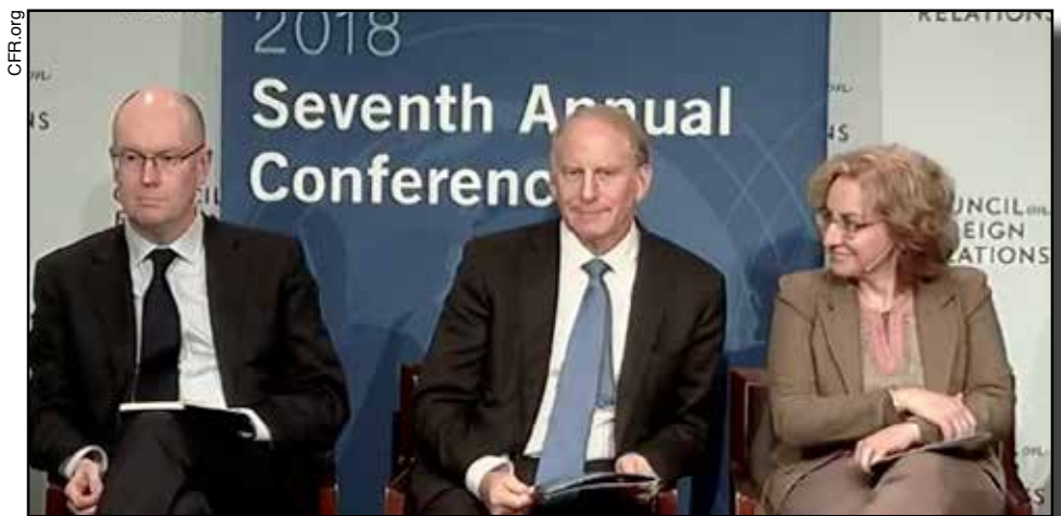
CFR President Richard N. Haass (center): In contrast to the CFR's public image above as a neutral think-tank, its members have long dominated federal policy to advance Internationalist-run world government and its steppingstones, such as USMCA.