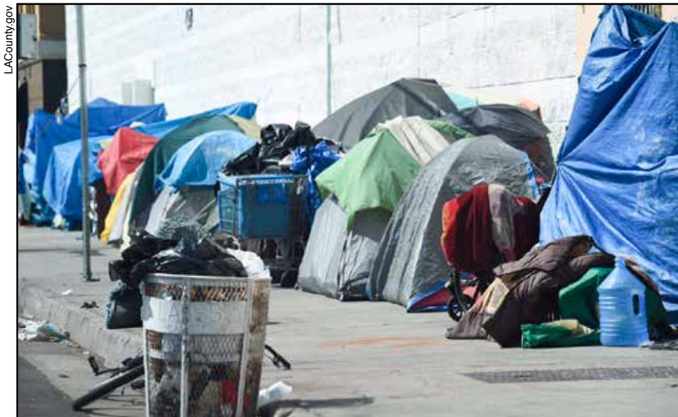
Los Angeles: Large sections of major U.S. cities now resemble Third World countries. For decades, uncontrolled immigration has fueled Third World colonization.

It was NOT regular order! The House had forfeited its leverage in the Senate. It was widely understood at the time that the House omnibus was dead on arrival in the Senate. The House vote was pure window dressing. The result has been a series of continuing resolutions, ignoring committee work, leading up to the latest “crisis” and