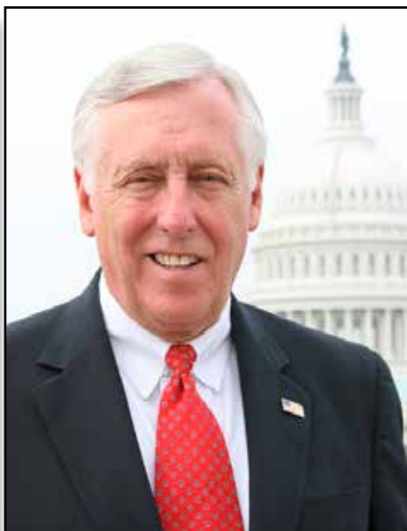
Rep. Nita Lowey (D-NY), “Ranking Member” of the Appropriations Committee, and Minority Whip Steny Hoyer (D-MD) look forward to a GOP FY2018 “compromise.”