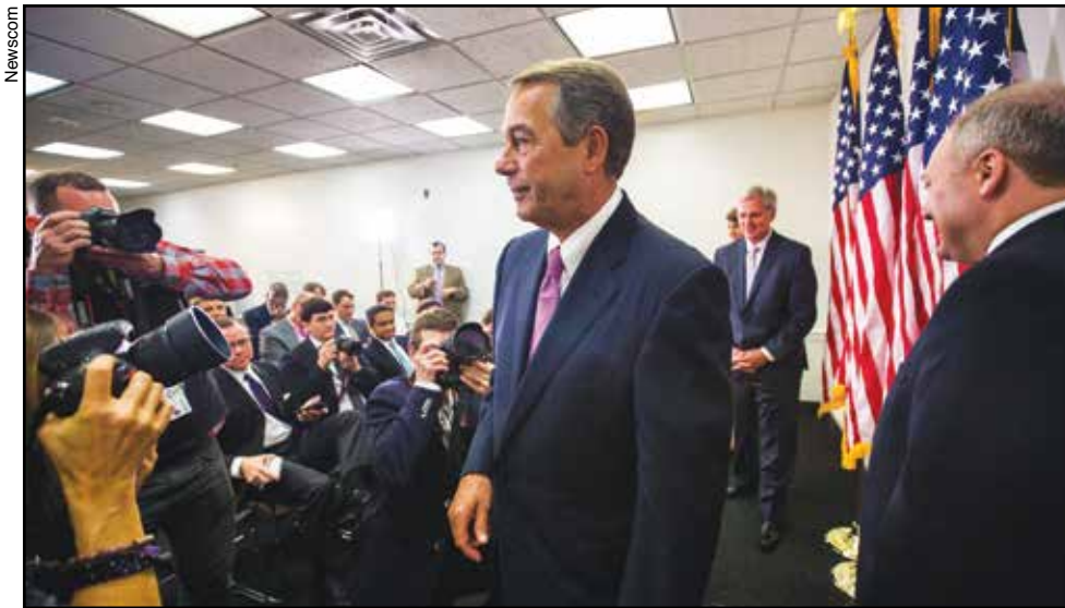
GOP "Leadership" Sells Out: Outgoing Speaker of the House John Boehner proudly announces a backroom budget agreement between Congress and the White House. House and Senate Democrats unanimously supported the deal vs. only a minority of the GOP.