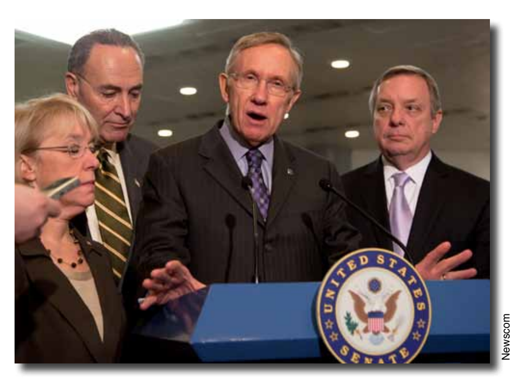
Party posturing supports charade: Senate Majority Leader Harry Reid stops before cameras (2/17/11) to blast Boehner for threatening a government shutdown without negotiating first. "We're terribly disappointed that Speaker Boehner can't control the votes in his caucus to prevent a shutdown of government." Reid said.

existence. For example, on February 8, the House leadership failed to muster a necessary two-thirds majority to extend temporary provisions of the Patriot Act — provisions objected to by conservatives and liberals alike as allowing government to spy on everyone. But Big Brother did not need to worry. Nine days later, the House reversed itself before the temporary authorization could expire and gave President Obama a new 90-day extension.