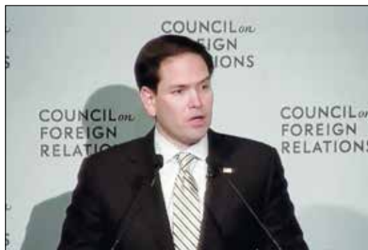
Seeking Insider support: On May 13, GOP presidential candidate Marco Rubio addressed the Council on Foreign Relations in New York.